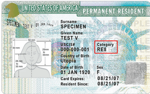
US Green card

The Green Card category code is used to describe the immigrant visa category that corresponds to the immigration petition you filed. It is located on the front side of the Green Card next to the cardholder's USCIS number. This field is also known as class of admission.